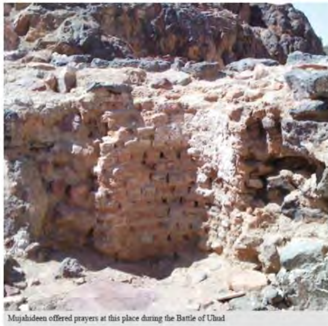
Mujahideen offered prayers at this place during the Battle of Uhud

Anas reportedly said that he saw ‘A’ishah Bint Abi Bakr and Umm Salim (his mother). Their garments were tucked up and their ankles exposed, while they carried water bags on their backs and offered water to the wounded. Among the women was Fatimah. (Al-Bukhari, al-Sahih, 2880.)