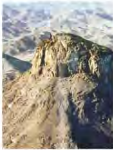
"Jabal-e-Noor" Hira Cave

still minors. In such cases, marriage would take effect only after each of the spouses reached puberty, approved of the marriage and the couple started living together.)