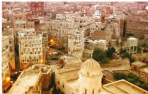
Old City of Sanaa Yemen

Khadijah's mother was Fatimah Bint Zahidah. She also belonged to the tribe of Quraysh. The Arabs were very particular about genealogy. The lineage of Khadijah (May Allah be pleased with her) can be traced back with certainty to Nazar Ibn Ma'ad Ibn 'Adnan. Interestingly, even the names of Khadijah's paternal grandmothers have been recorded as far back as 'Adnan. Not just that, the names of her maternal grandmothers have also been recorded as far back as six generations.